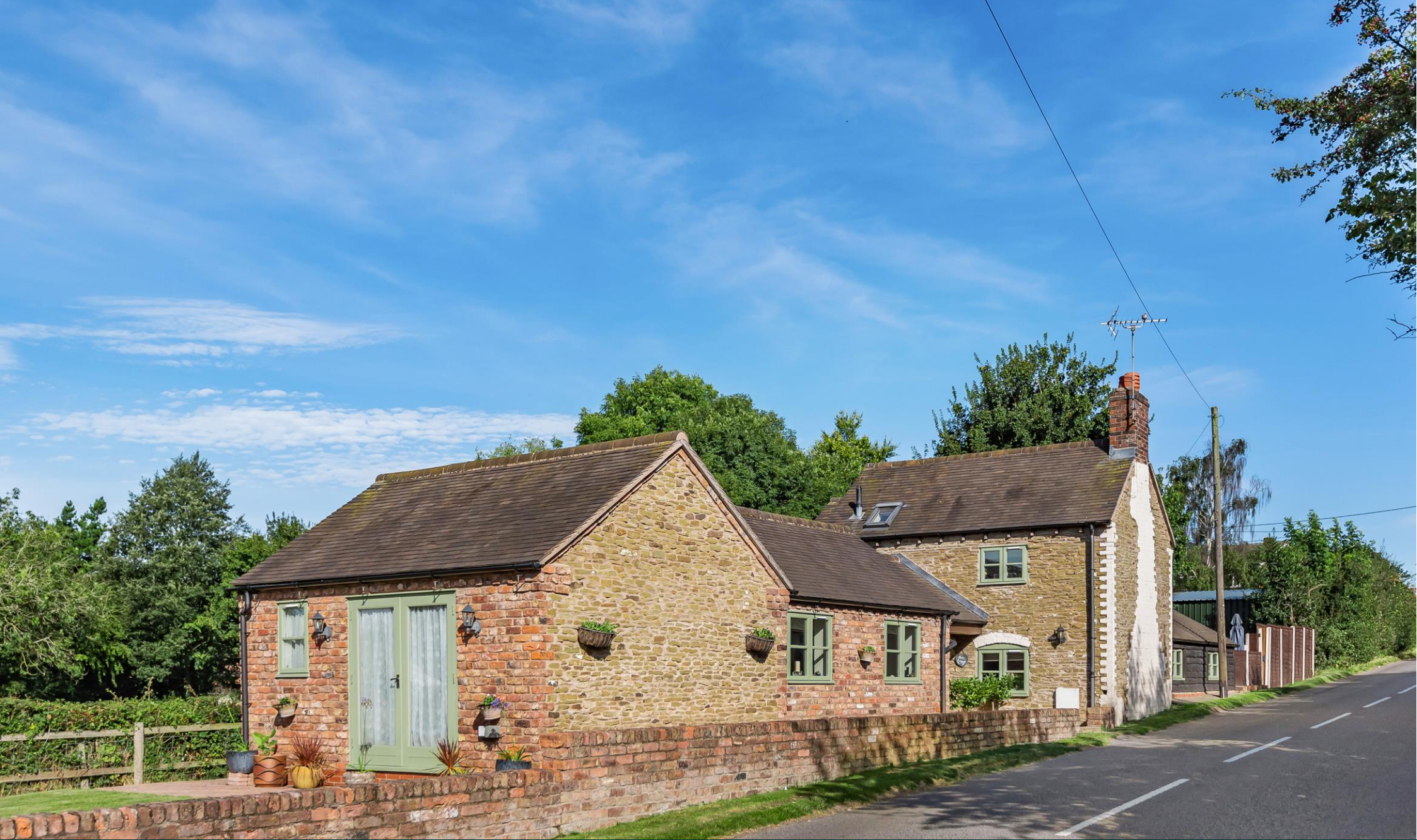
Hope Cottage, Bliss Gate Road, Rock, Worcestershire