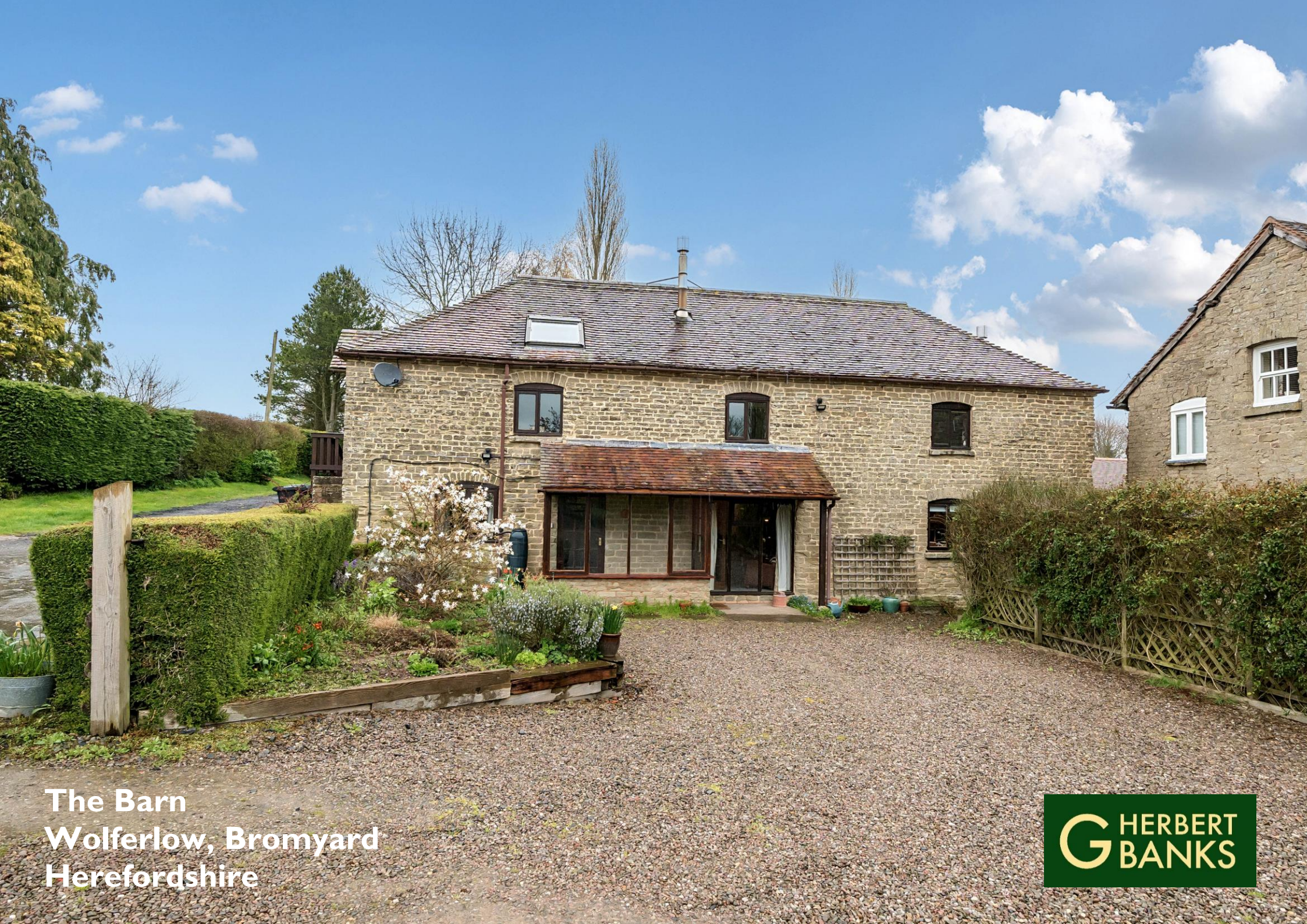
The Barn Wolferlow, Bromyard Herefordshire