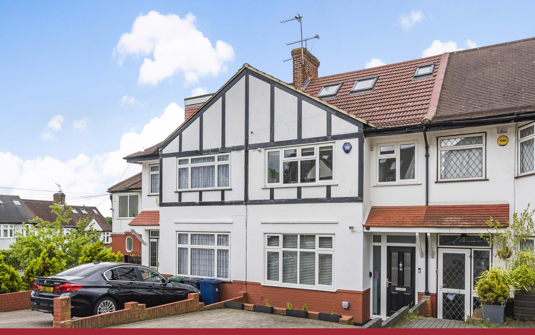
Ferney Road, Barnet, EN4 8LE