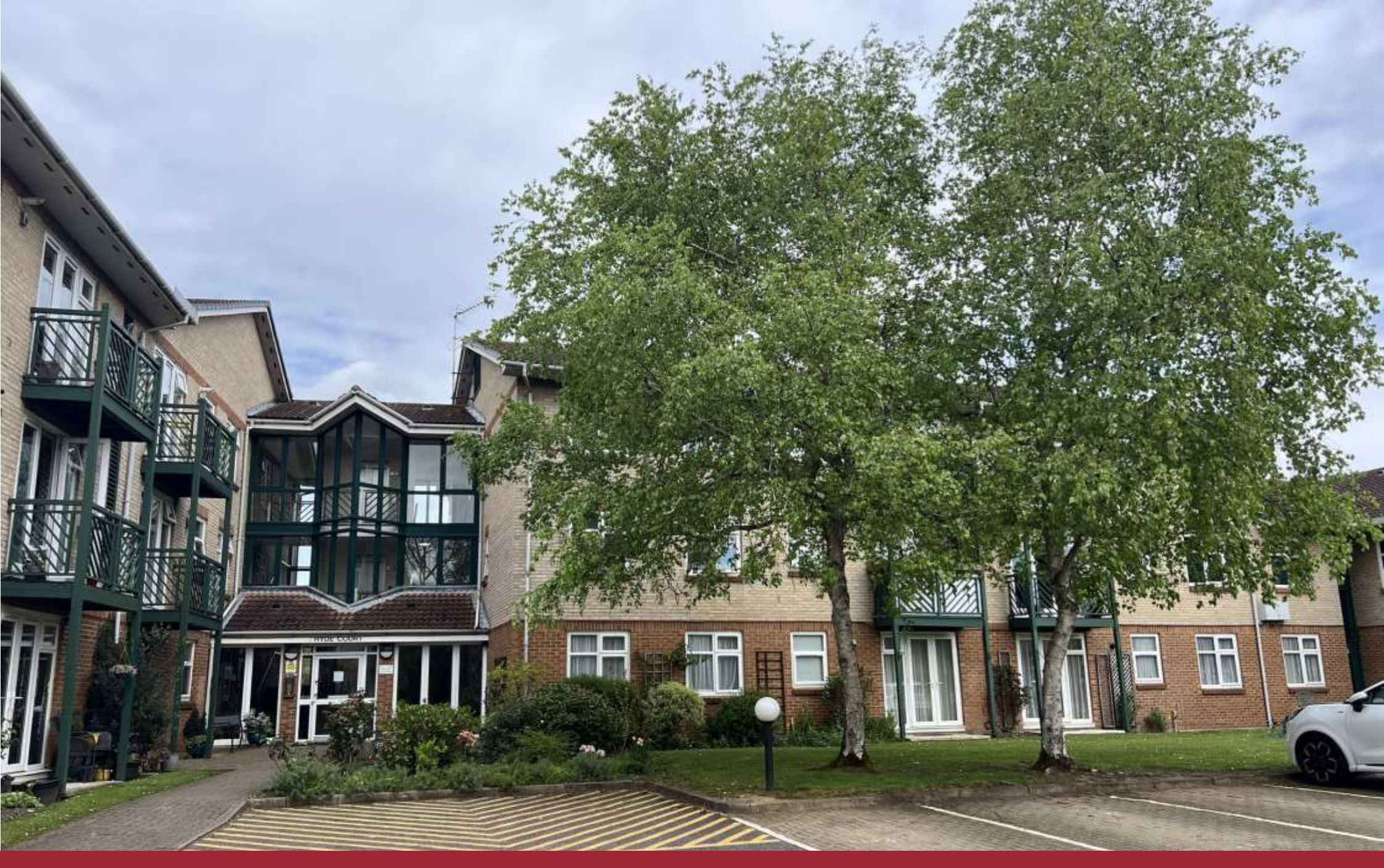
Hyde Court, Friern Barnet Lane, N20 0YD