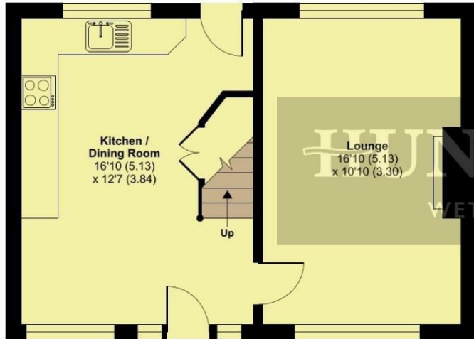
GROUND FLOOR APPROX FLOOR AREA 37.5 SQ M (404 SQ FT)