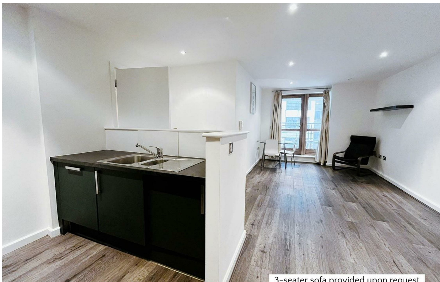
3-seater sofa provided upon request