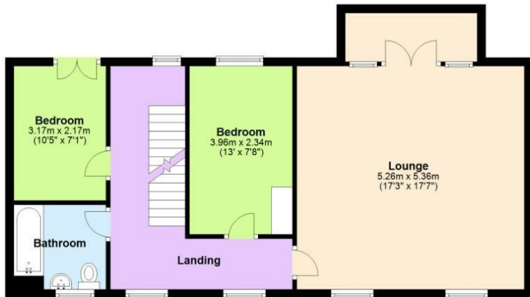
First Floor Approx. 67.1 sq. metres (722.2 sq. feet)