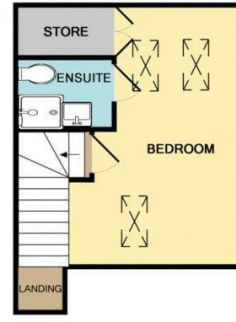
2ND FLOOR APPROX. FLOOR AREA 282 SQ.FT. (24.3 SQ.M.)

TOTAL APPROX. FLOOR AREA 1104 SQ.FT. (102.5 SQ.M.) Whilst every attempt has been made to ensure the accuracy of the floor plan contained here, measurements of doors, windows, rooms and any other items are approximate and no responsibility is taken for any error, omission, or mis-statement. This plan is for illustrative purposes only and should be used as such by any prospective purchaser. The services, systems and appliances shown have not been tested and no guarantee as to their operability or efficiency can be given Made with Metropix ©2018