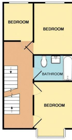
1ST FLOOR APPROX. FLOOR AREA 408 SQ.FT. (37.9 SQ.M.)