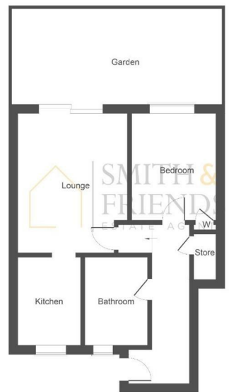
Not to Scale. Produced by The Plan Portal 2025 For Illustrative Purposes Only.