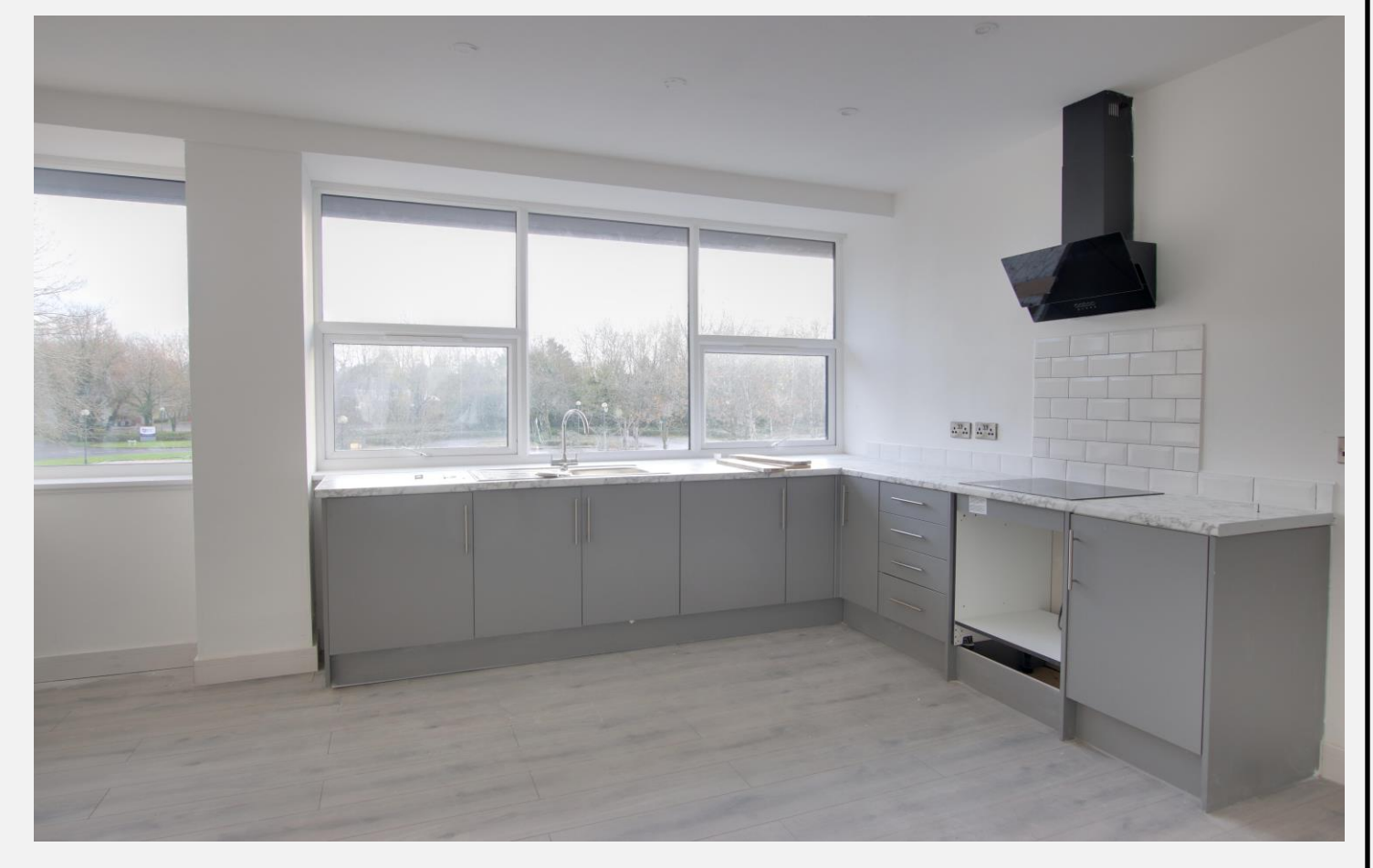
104 Pavilions Court Windsor Road Trowbridge BA14 0GB