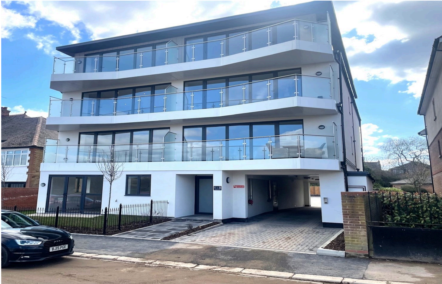
Forest View, Chingford, E4

loughton@spencermunson.co.uk Website: spencermunson.co.uk