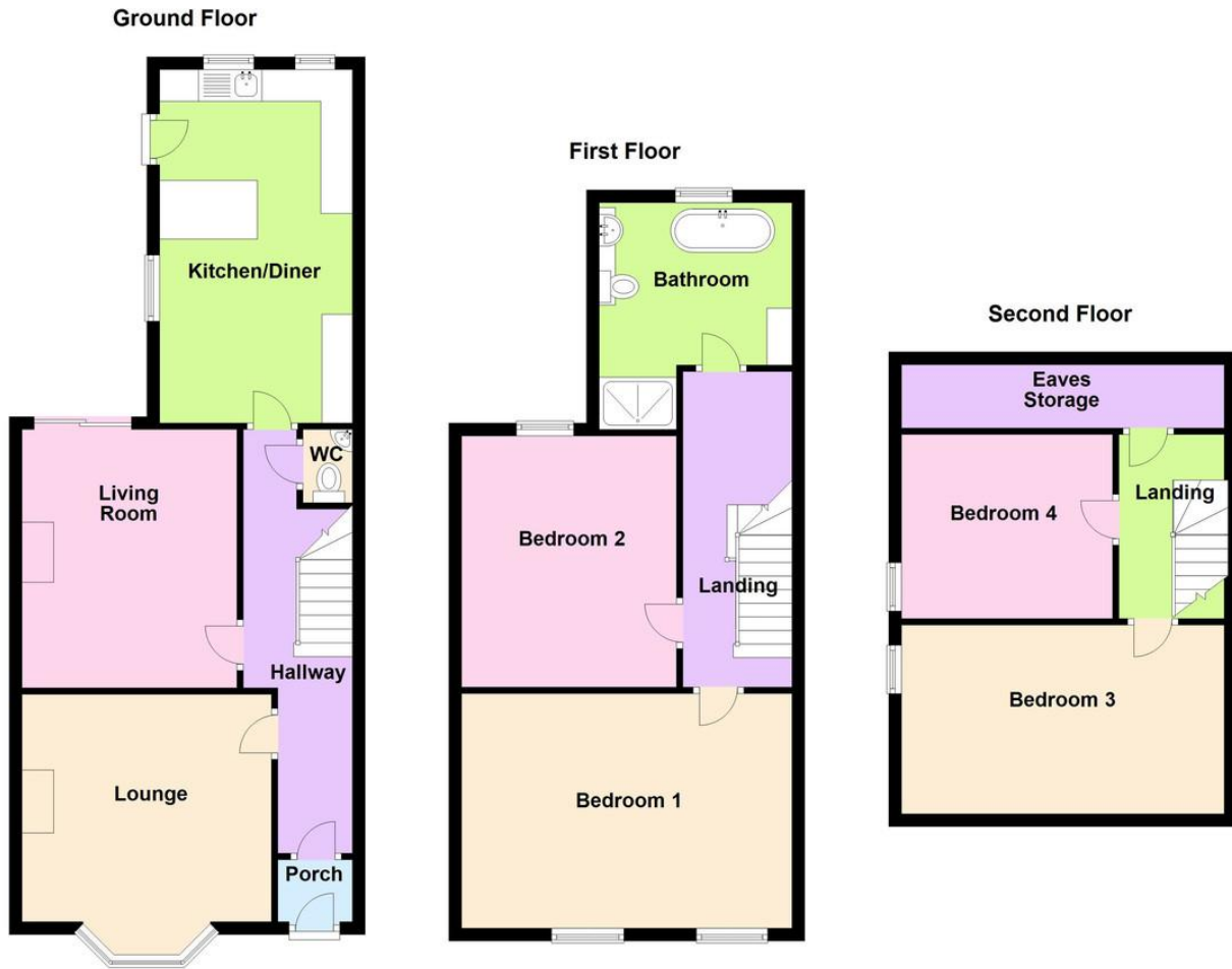
Floor plans are to show layout only and are not drawn to scale.

MONEY LAUNDERING REGULATIONS: Under the Money Laundering Rules 2007, The Proceeds of Crime Act 2002 and The Terrorism Act 2000 the Agent is legally obliged to verify the identity of the Client through sight of legally recognised photographic identification (e.g. passport, photographic drivers licence) and documentary proof of address