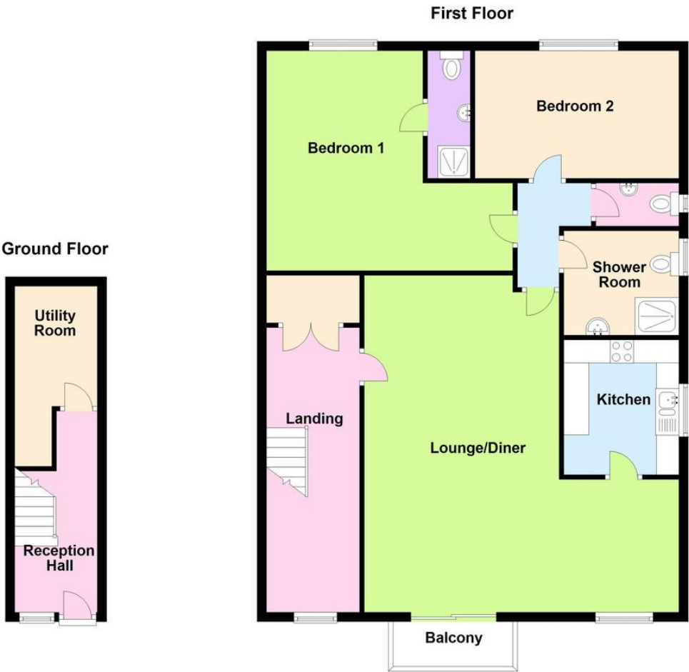
Floor plans are to show layout only and are not drawn to scale.

MONEY LAUNDERING REGULATIONS: Under the Money Laundering Rules 2007, The Proceeds of Crime Act 2002 and The Terrorism Act 2000 the Agent is legally obliged to verify the identity of the Client through sight of legally recognised photographic identification (e.g. passport, photographic drivers licence) and documentary proof of address