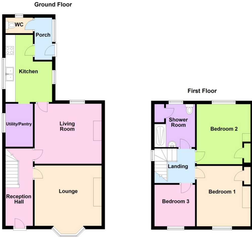
Floor plans are to show layout only and not drawn to scale.

MONEY LAUNDERING REGULATIONS: Under the Money Laundering Rules 2007, The Proceeds of Crime Act 2002 and The Terrorism Act 2000 the Agent is legally obliged to verify the identity of the Client through sight of legally recognised photographic identification (e.g. passport, photographic drivers licence) and documentary proof of address