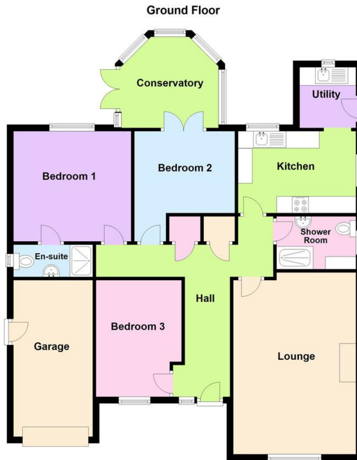
Floor plans are to show layout only and are not drawn to scale.

MONEY LAUNDERING REGULATIONS: Under the Money Laundering Rules 2007, The Proceeds of Crime Act 2002 and The Terrorism Act 2000 the Agent is legally obliged to verify the identity of the Client through sight of legally recognised photographic identification (e.g. passport, photographic drivers licence) and documentary proof of address