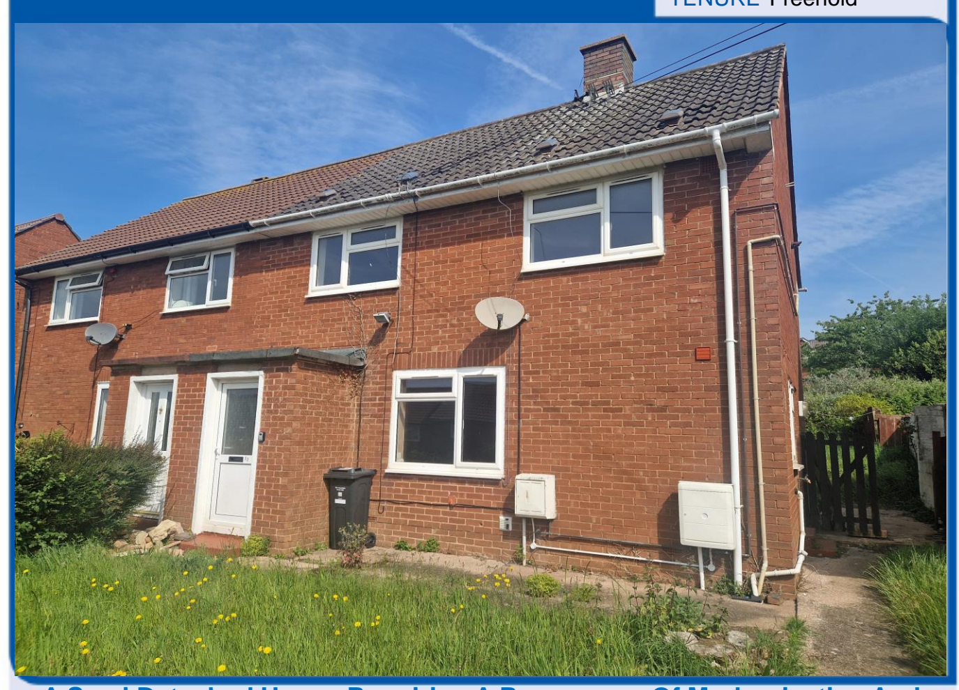
A Semi Detached House Requiring A Programme Of Modernisation And Refurbishment With Large Gardens And Offered For Sale With No Ongoing Chain

32 Berry Close, Exmouth, EX8 2PT GUIDE PRICE £230,000 TENURE Freehold