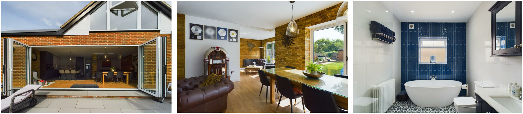
You may download, store and use the material for your own personal use and research. You may not republish, retransmit, redistribute or otherwise make the material available to any party or make the same available on any website. These particulars, whilst believed to be accurate are set out as a general outline only for guidance and do not constitute any part of an offer or contract. Intending purchasers should not rely on them as statements or representation of fact, but must satisfy themselves by inspection or otherwise as to their accuracy. No person in this firms employment has the authority to make or give any representation or warranty in respect of the property.