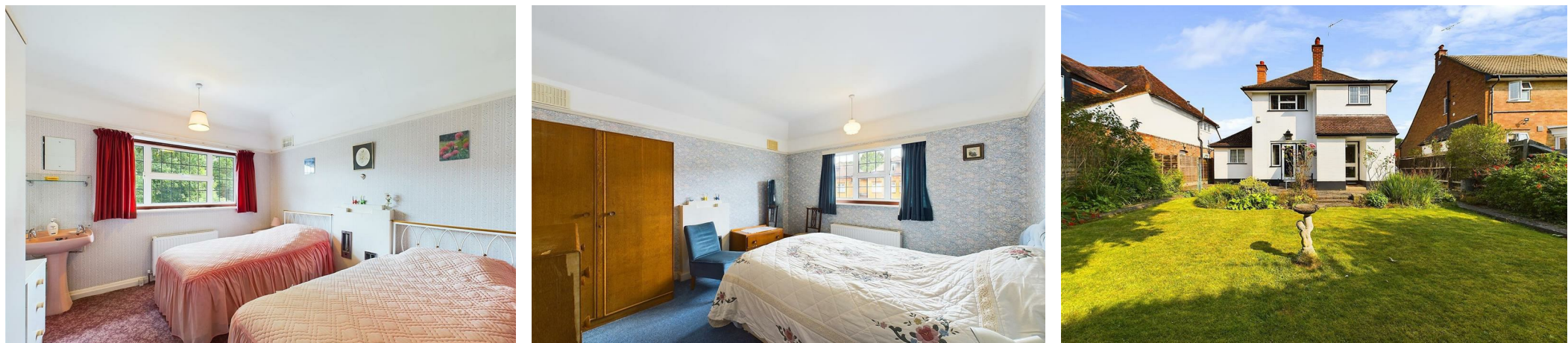
You may download, store and use the material for your own personal use and research. You may not republish, retransmit, redistribute or otherwise make the material available to any party or make the same available on any website. These particulars, whilst believed to be accurate are set out as a general outline only for guidance and do not constitute any part of an offer or contract. Intending purchasers should not rely on them as statements or representation of fact, but must satisfy themselves by inspection or otherwise as to their accuracy. No person in this firms employment has the authority to make or give any representation or warranty in respect of the property.