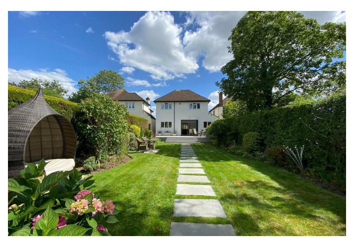
You may download, store and use the material for your own personal use and research. You may not republish, retransmit, redistribute or otherwise make the material available to any party or make the same available on any website. These particulars, whilst believed to be accurate are set out as a general outline only for guidance and do not constitute any part of an offer or contract. Intending purchasers should not rely on them as statements or representation of fact, but must satisfy themselves by inspection or otherwise as to their accuracy. No person in this firms employment has the authority to make or give any representation or warranty in respect of the property.