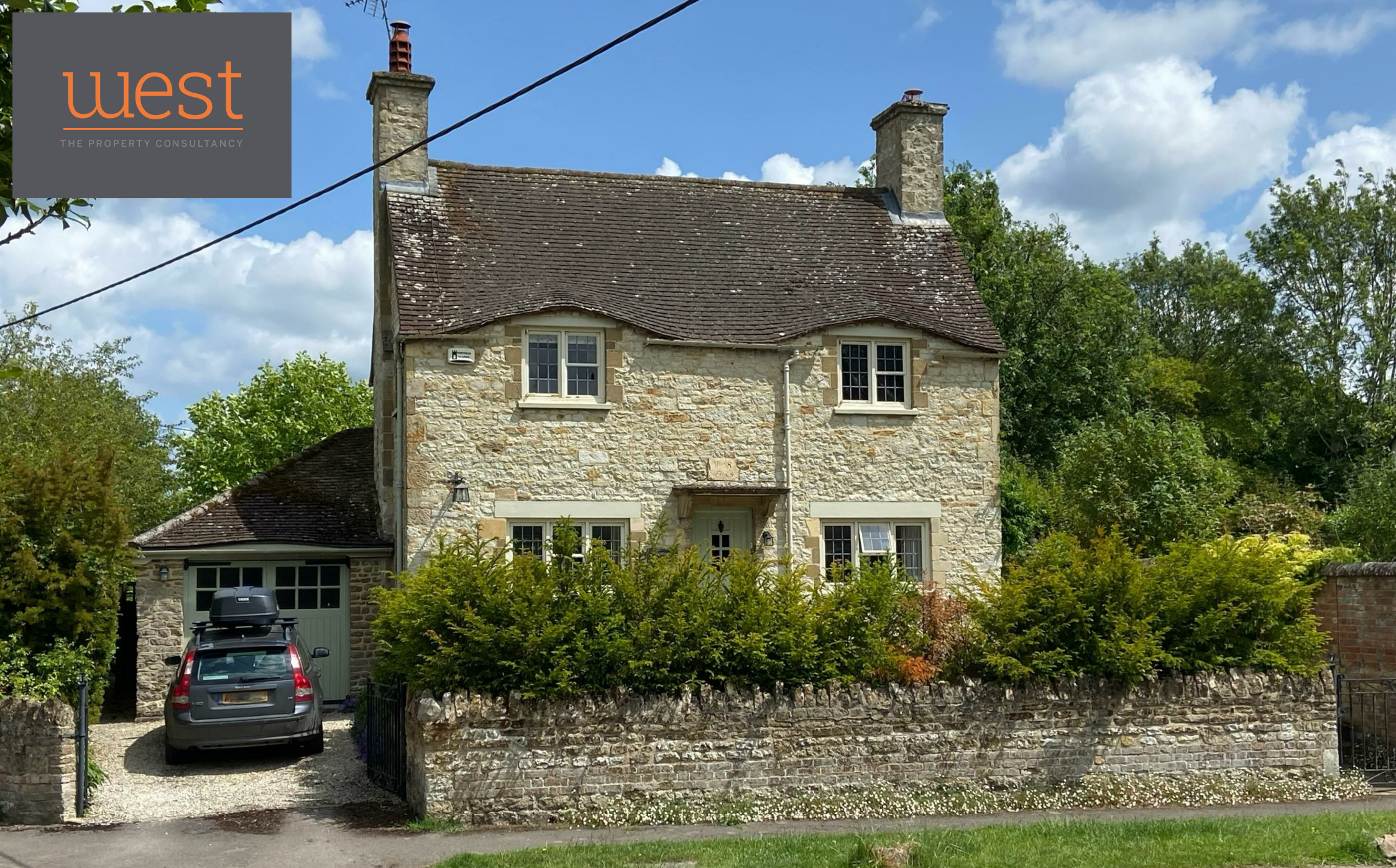
Rosemary`s Cottage Church Row Childrey Nr Wantage, OX12 9UT £2,750 PCM