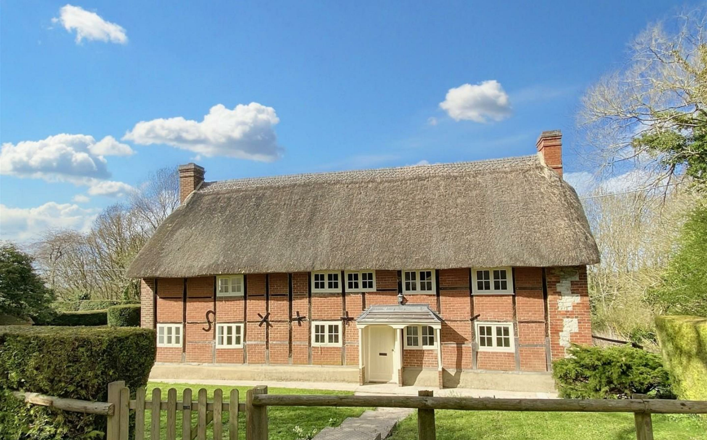
Thatched Cottage Knighton, SN6 8NT £2,150 Per Month