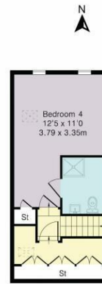
Annex First Floor