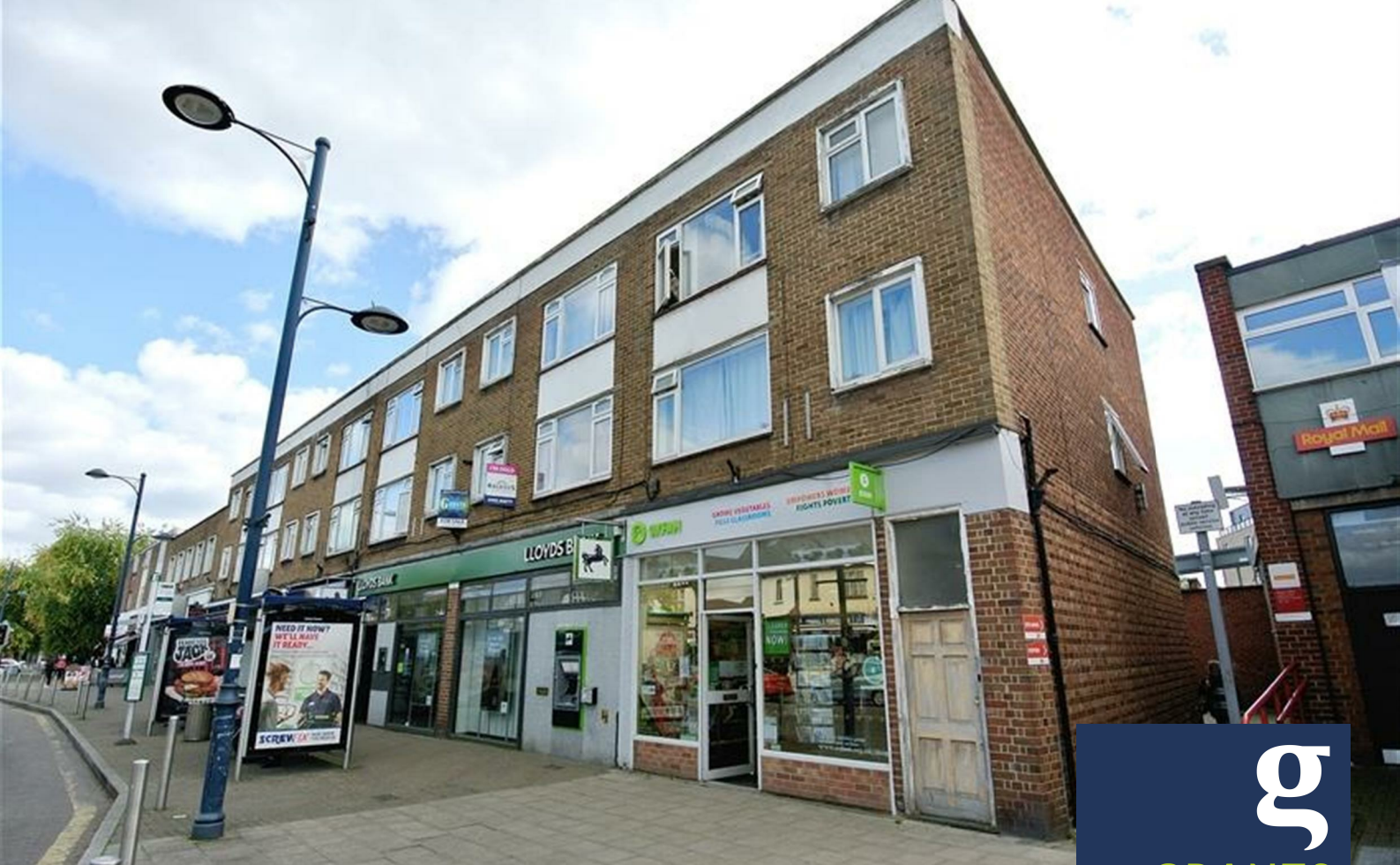
Station Road, Addlestone, KT15 2AD