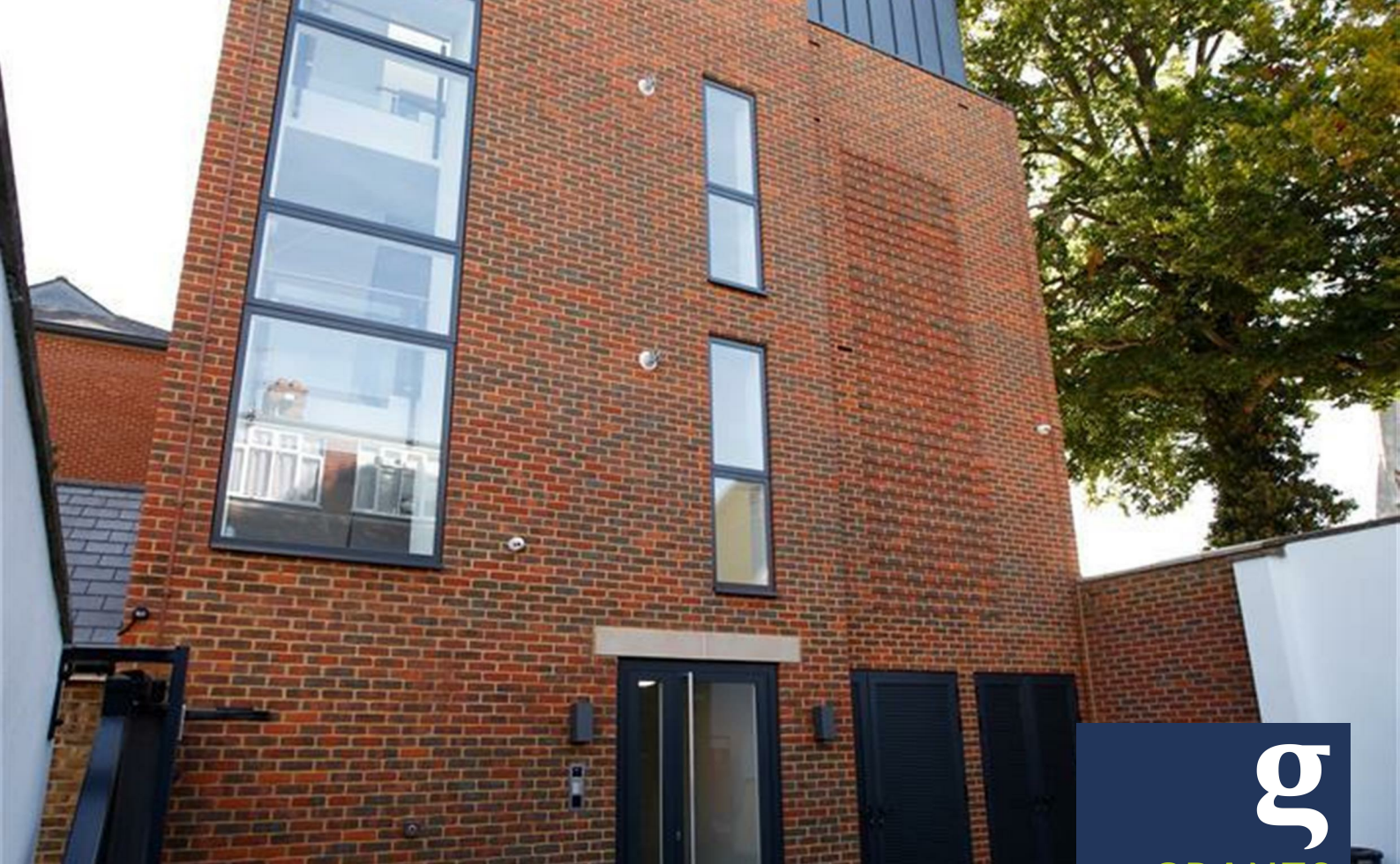
Churchfield Road, Weybridge, KT13 8DB