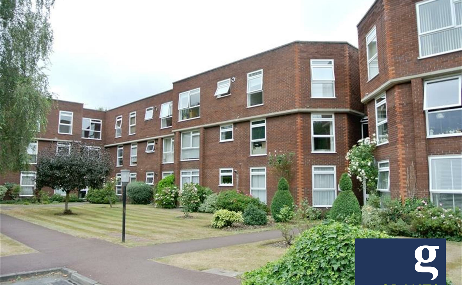
Queens Court, Ellesmere Road, KT13 0HX