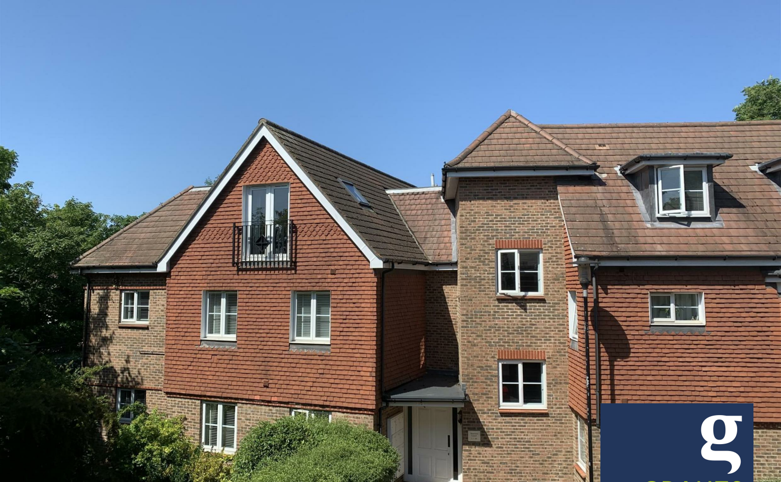
Wey Road, Weybridge, KT13 8GZ