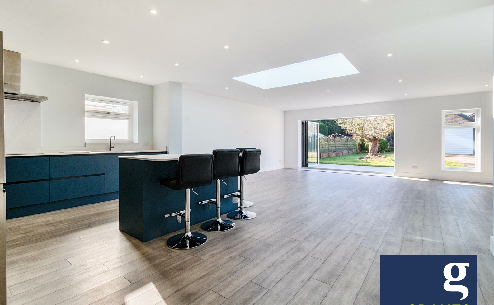
Green Lane, Chertsey, KT16 9QS