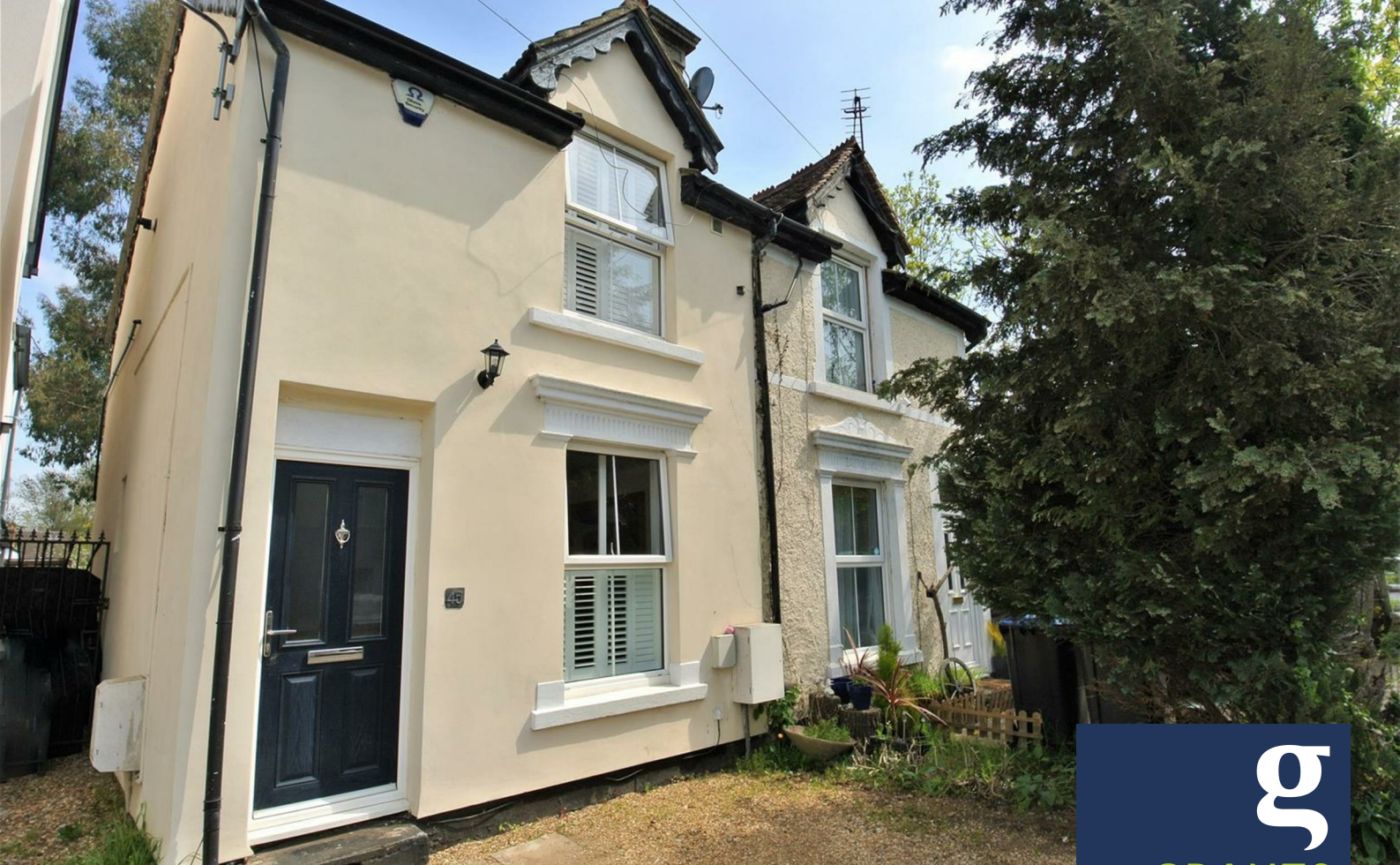
Alexandra Road, Addlestone, KT15 2PQ