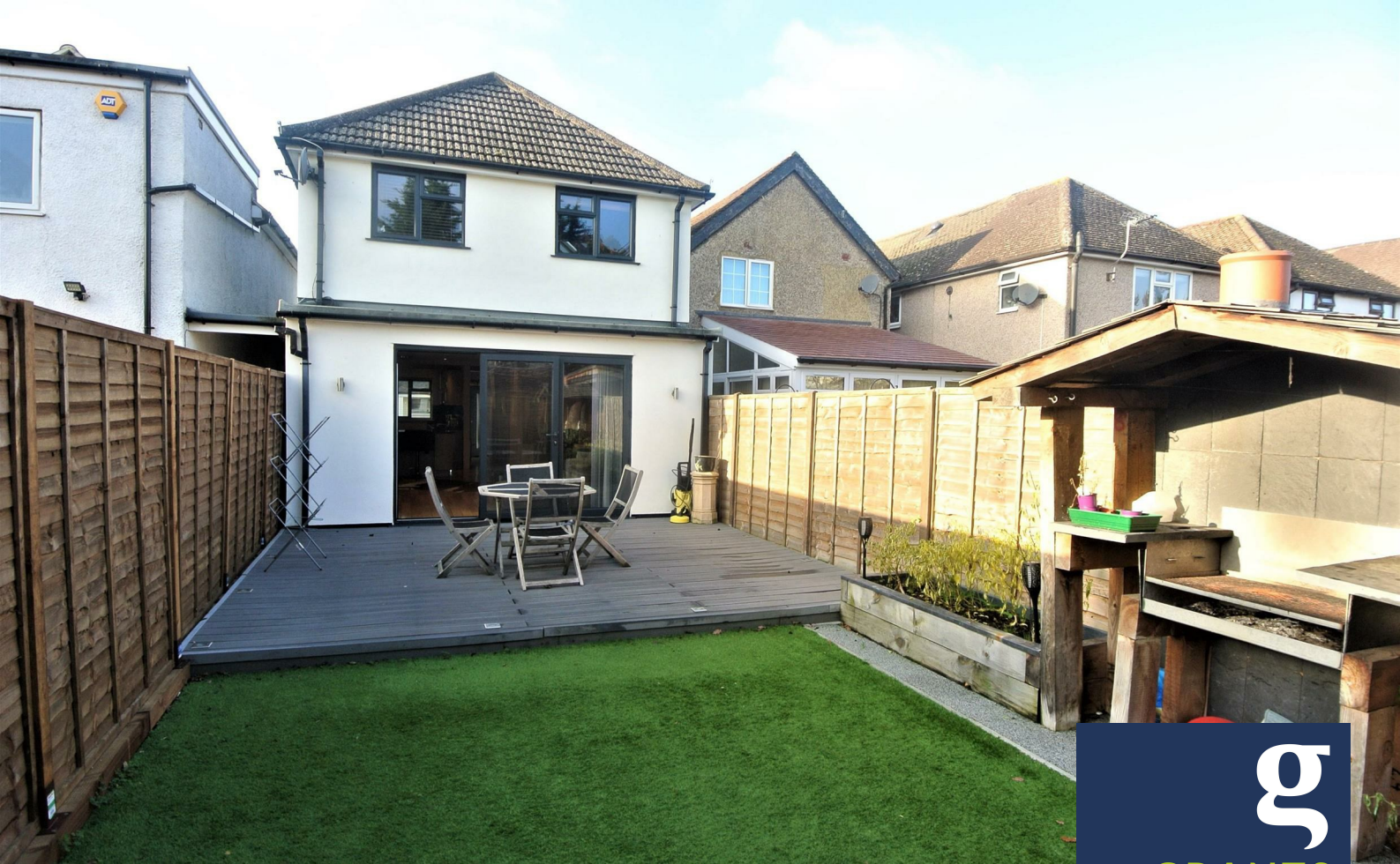
Bourneside Road, Addlestone, KT15 2JD