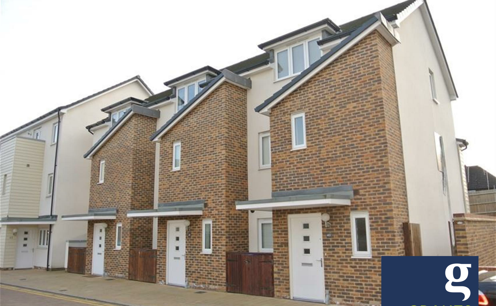
Pyle Close, Addlestone, KT15 2FF