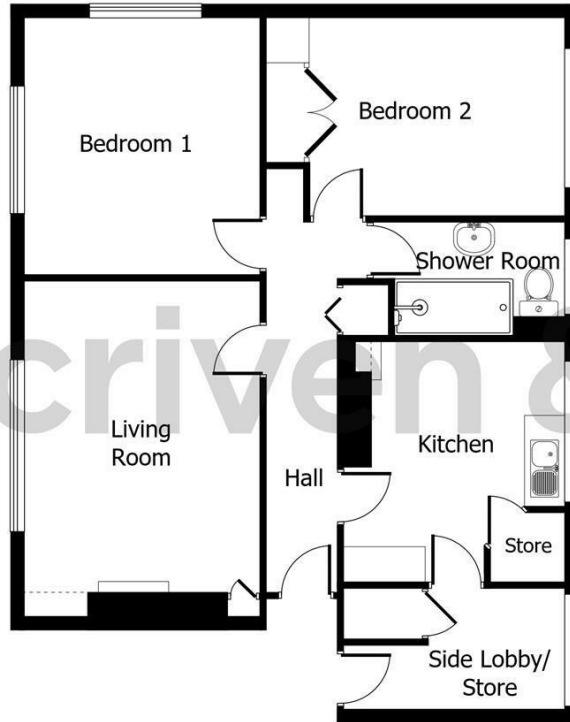
Not to scale. This floor plan is for illustration purposes only. The position and size of doors, windows and other features are approximate.