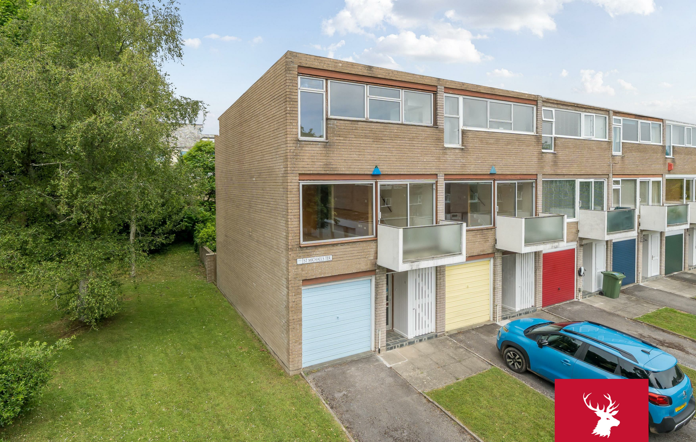
1 St. Michaels Terrace