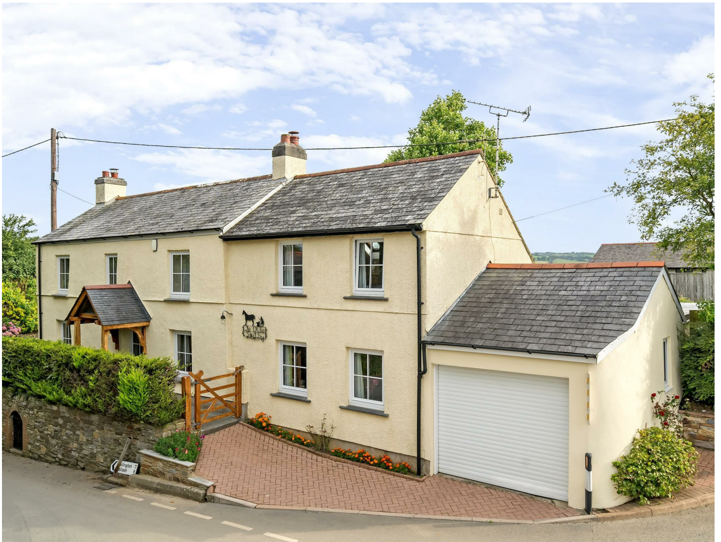
The Old Smithy