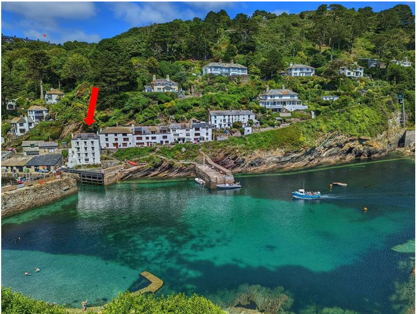
Island House & Island Cottage