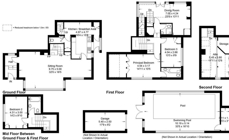
Illustration for identification purposes only, measurements are approximate, not to scale. floorplansUsketch.com © (ID1058873)

IMPORTANT: Stags gives notice that: 1. These particulars are a general guide to the description of the property and are not to be relied upon for any purpose. 2. These particulars do not constitute part of an offer or contract. 3. We have not carried out a structural survey and the services, appliances and fittings have not been tested or assessed. Purchasers must satisfy themselves. 4. All photographs, measurements, floorplans and distances referred to are given as a guide only. 5. It should not be assumed that the property has all necessary planning, building regulation or other consents. 6. Whilst we have tried to describe the property as accurately as possible, if there is anything you have particular concerns over or sensitivities to, or would like further information about, please ask prior to arranging a viewing.