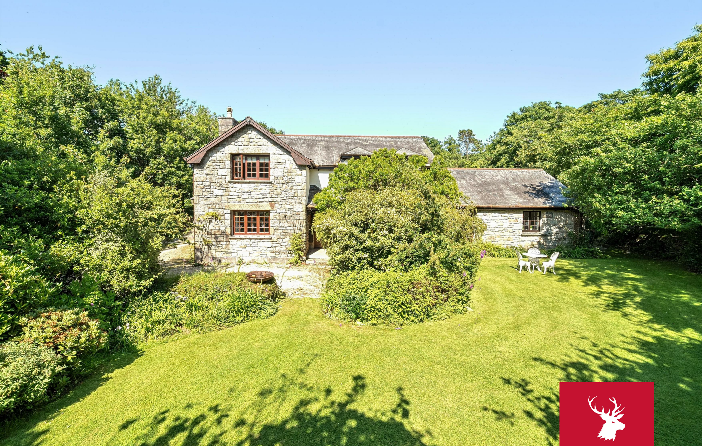
Tregray House, Tregajorran