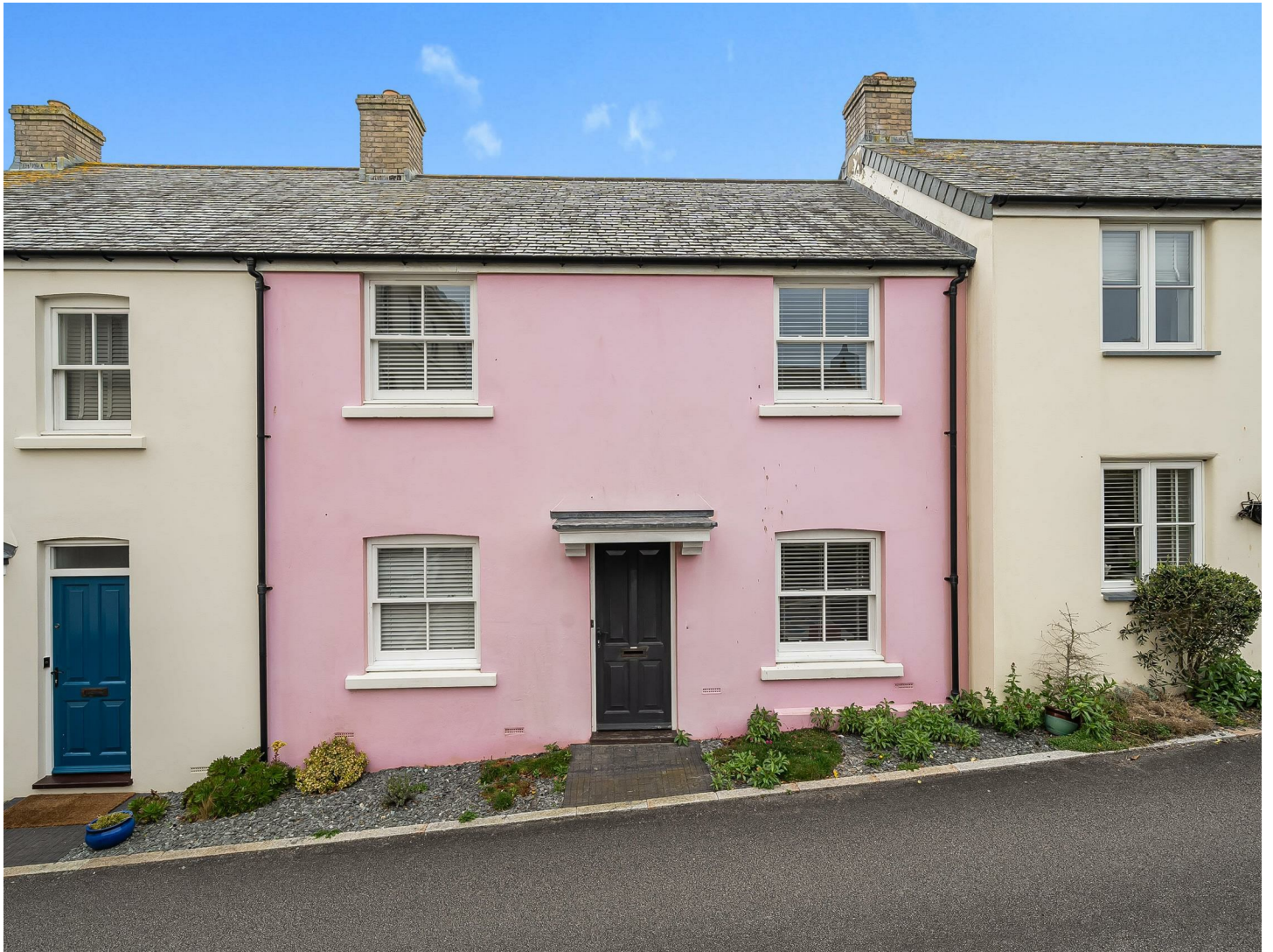
Sea Pink Cottage