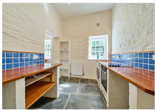
Fowey - 12.5 miles Plymouth - 30 miles A30(T) - 2 miles Truro - 27 miles