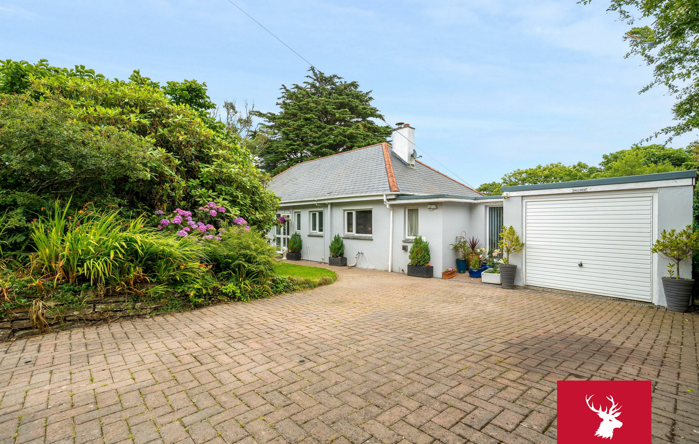
Hillside, Banns Road