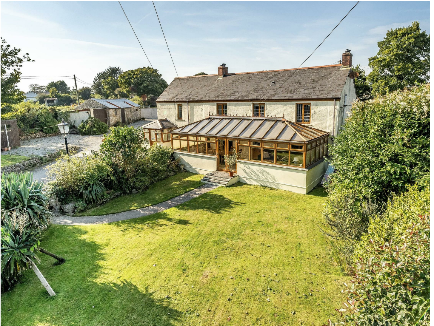
Trevenen Farmhouse (Lot 1)