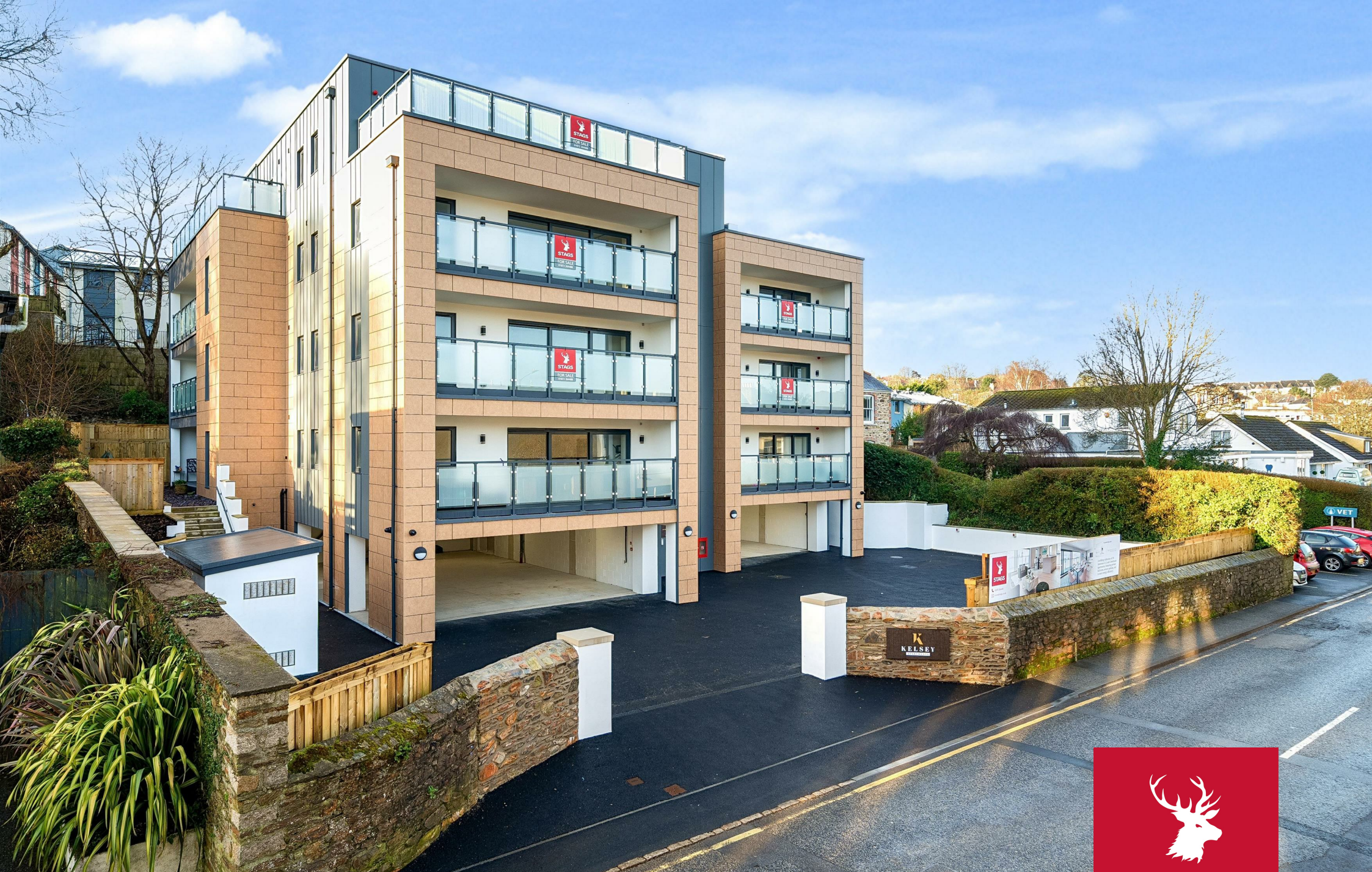
Flat 7, Kelsey Apartments