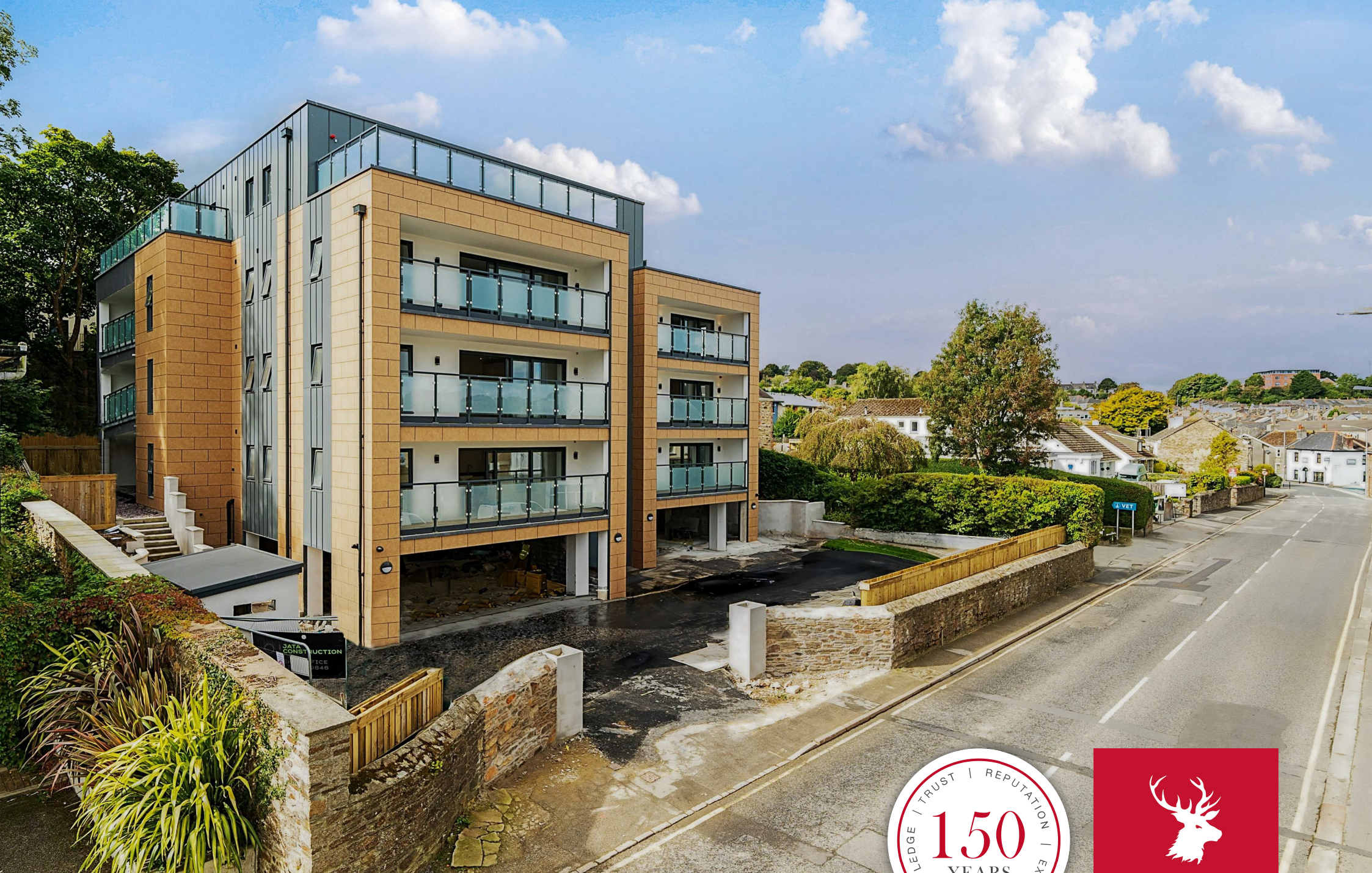
Flat 9, Kelsey Apartments