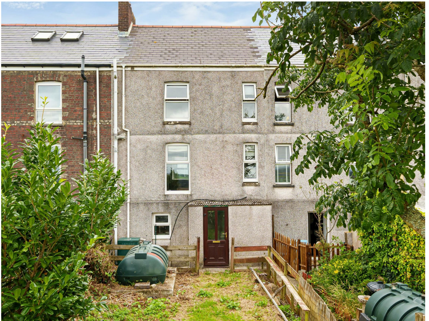
3 Seaview Terrace