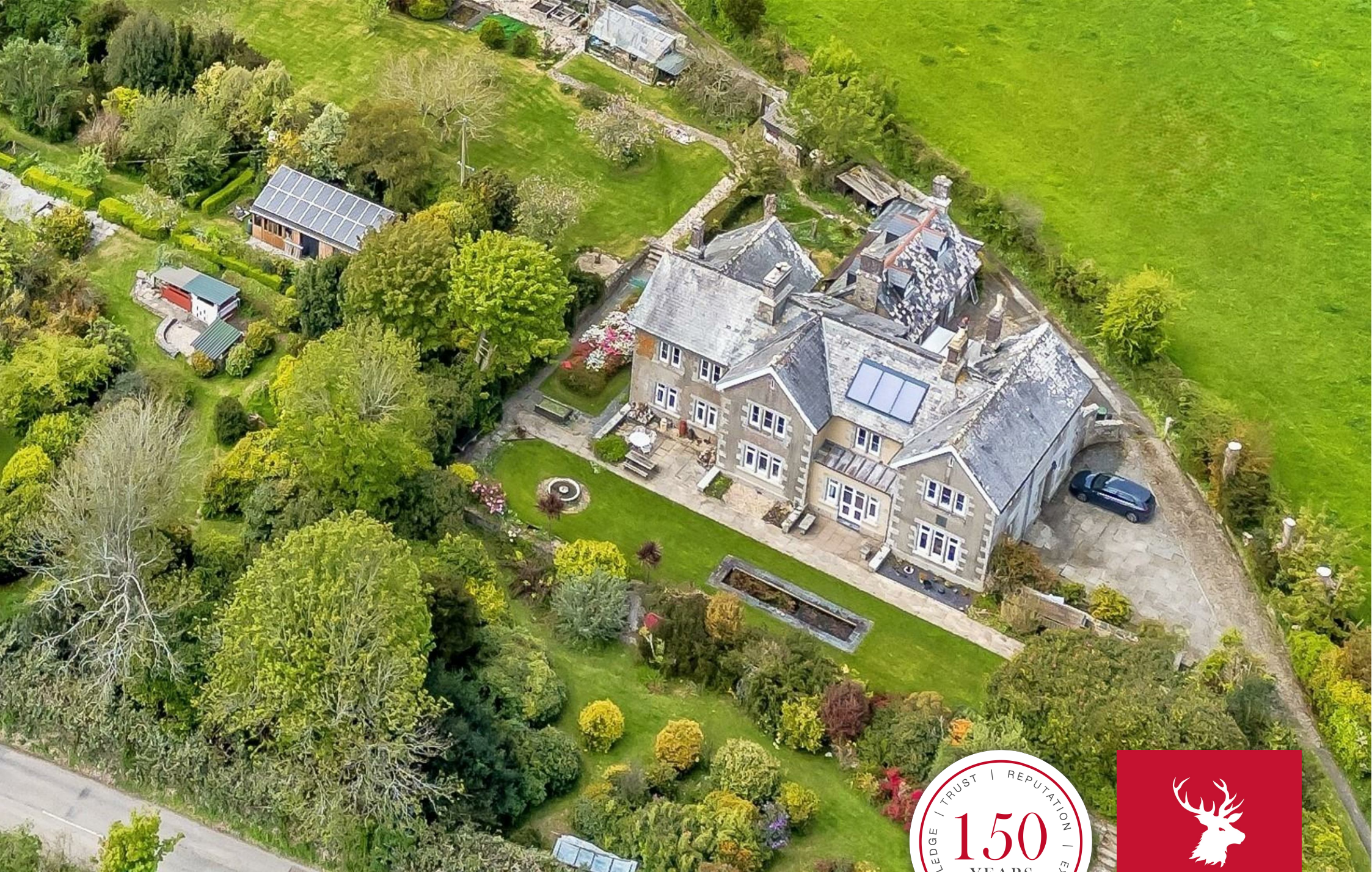
Trannack House - Lot 1