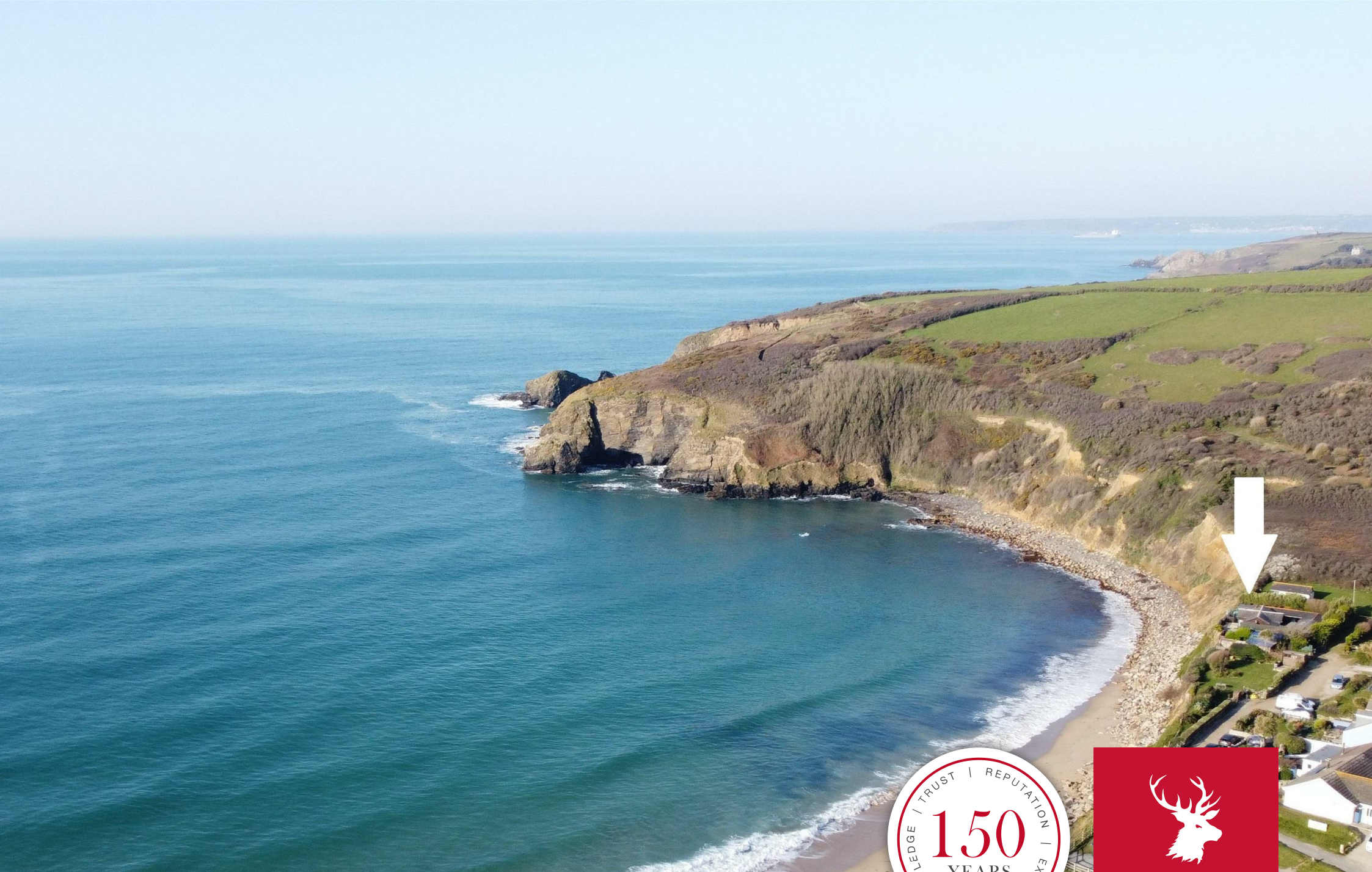
Hoe Point Cottage