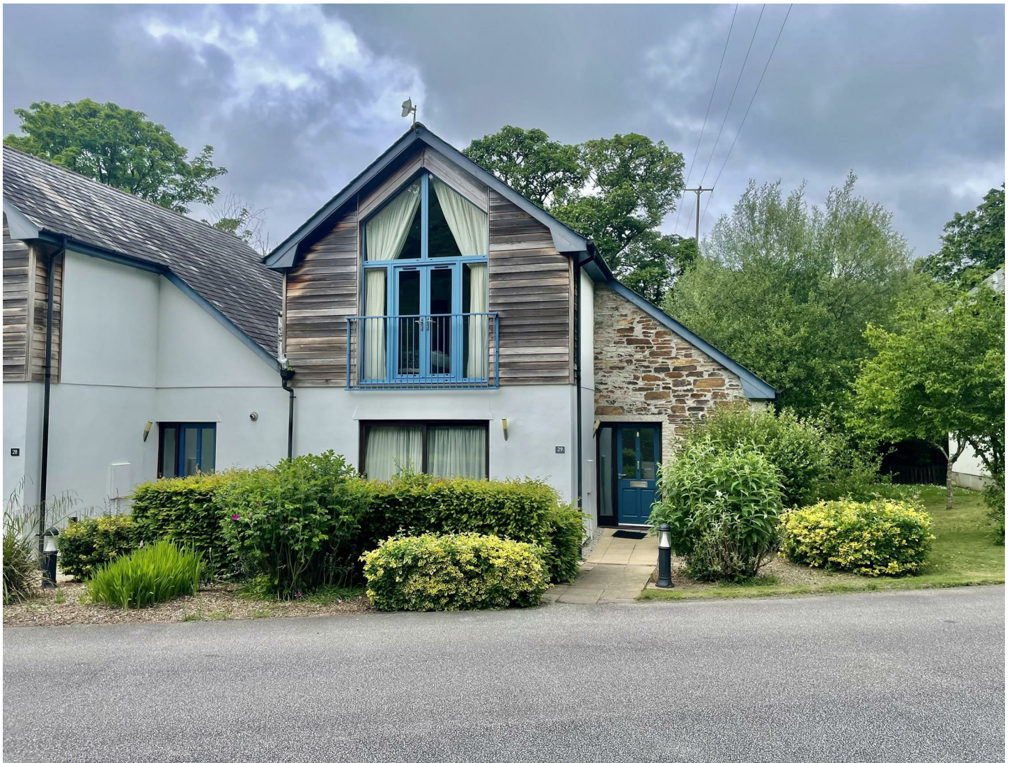
Cottage 29, The Valley