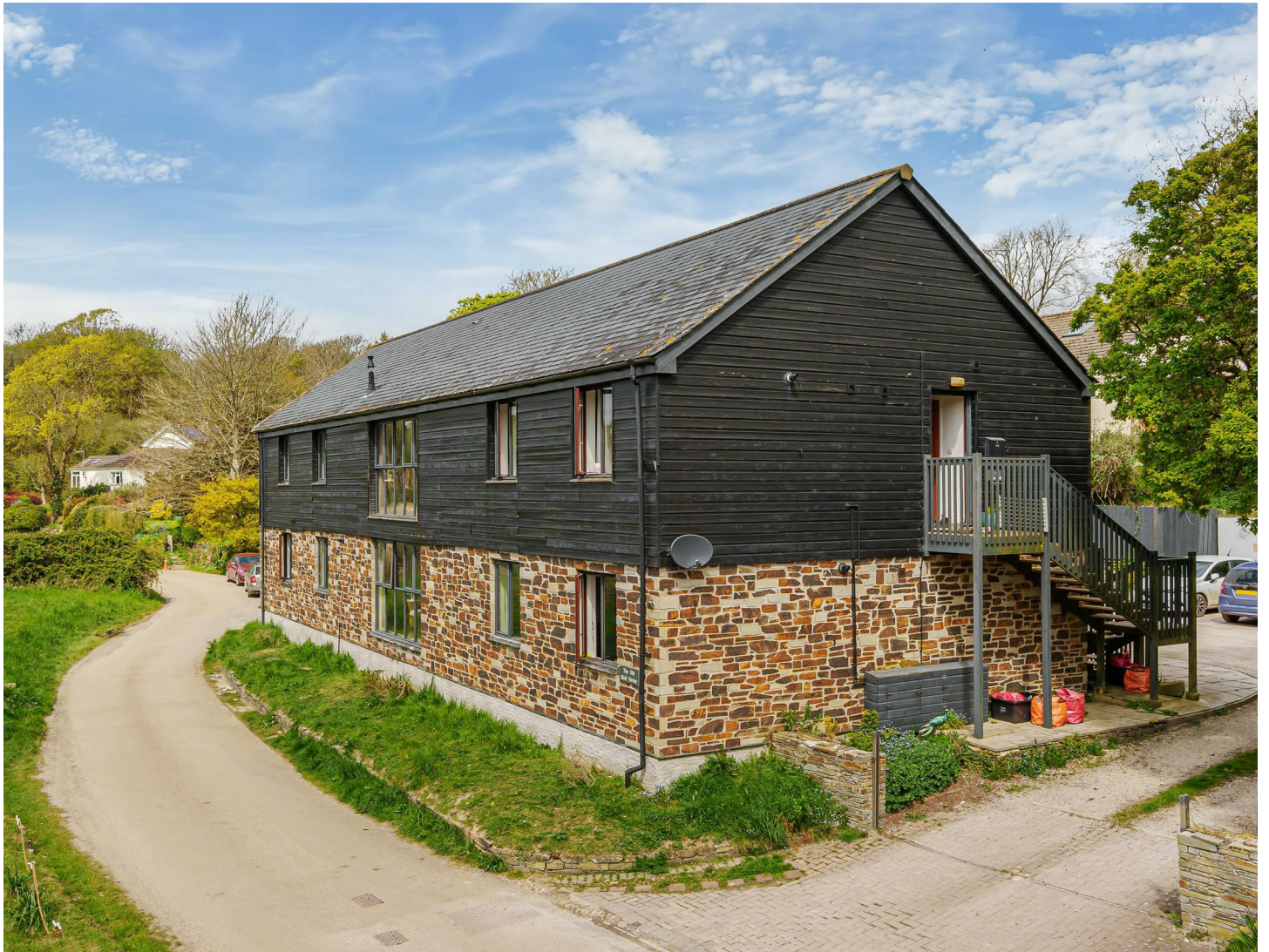
9 The Old Malthouse