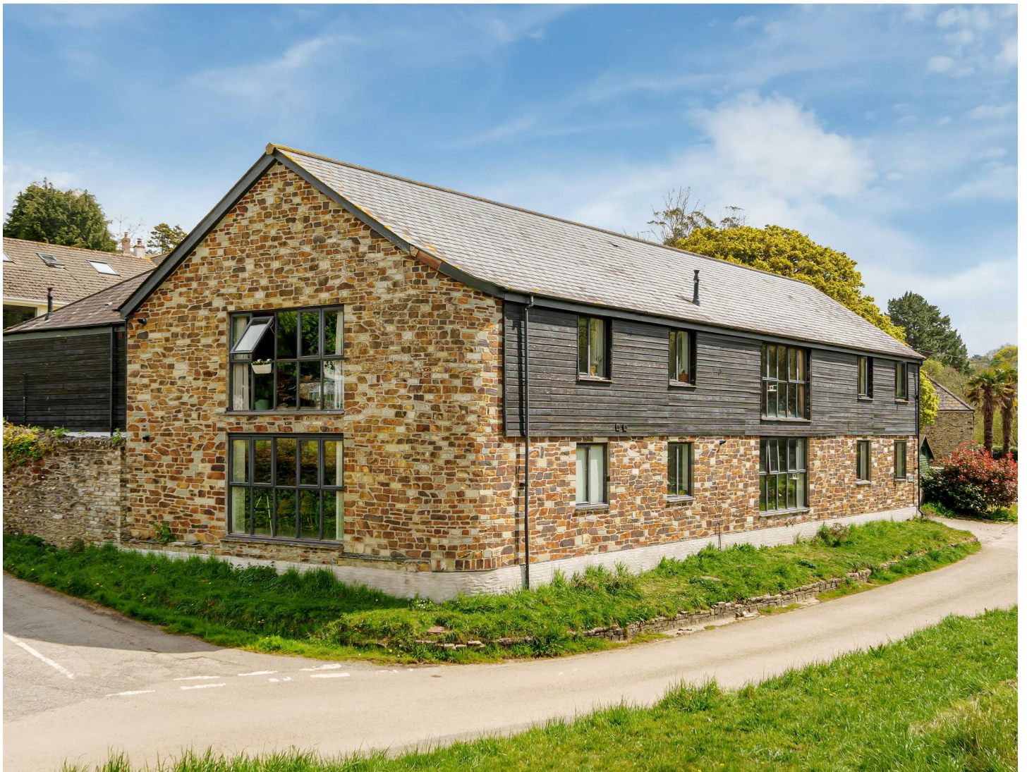
4 The Old Malthouse