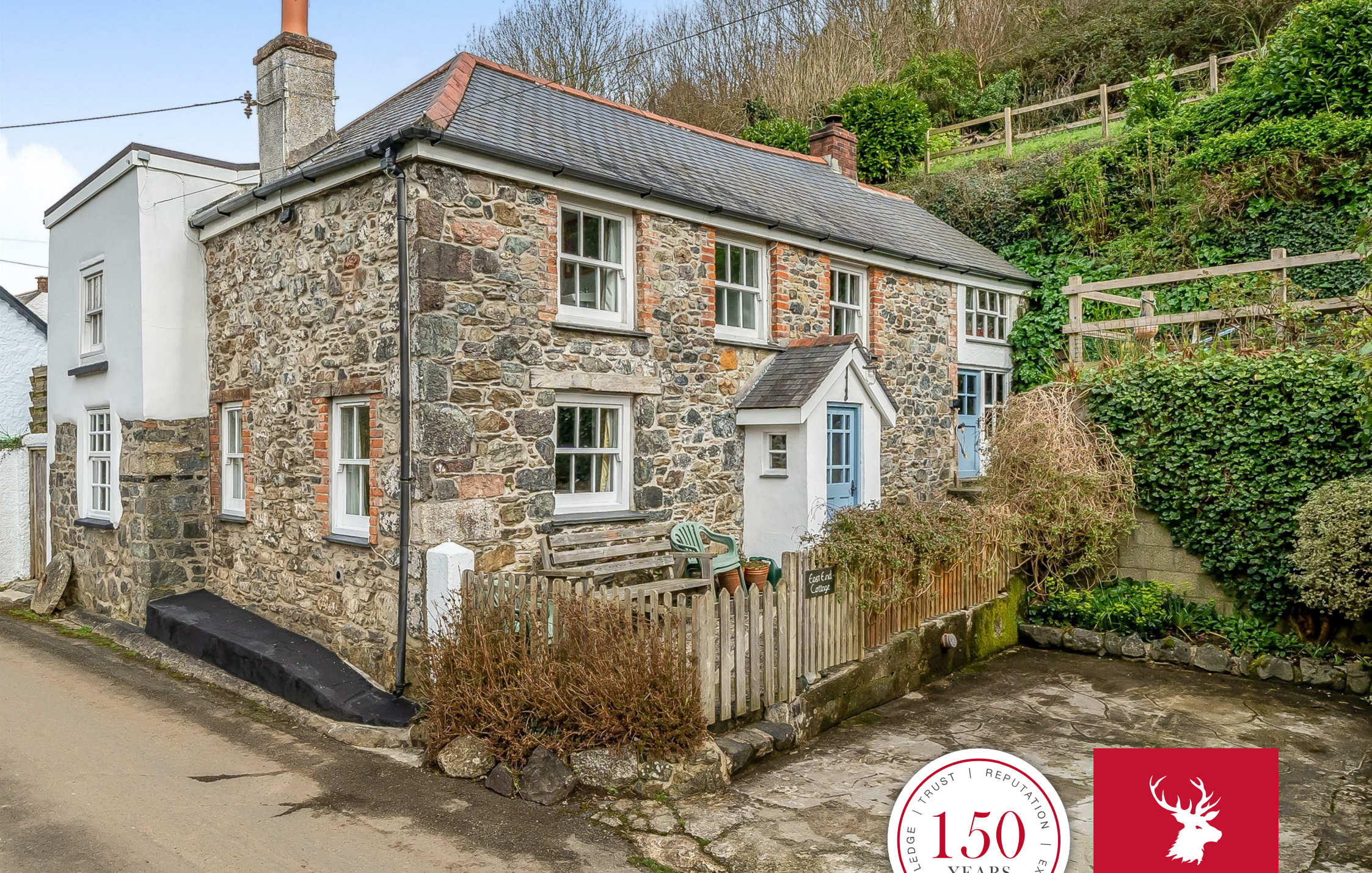
East End Cottage