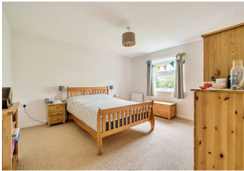
City Centre Location